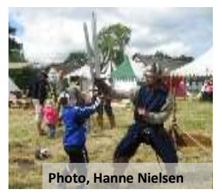
The Medieval Festival

Aqua Forum Horsens offers pure enjoyment with top modern facilities for swimming, play, being active and general well-being. While you are there, why not try their hot tub, steam bath, sauna or tylarium?