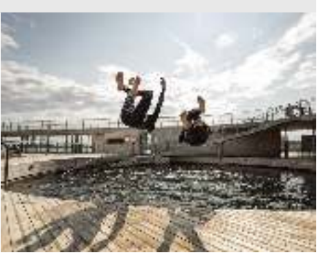
The Harbour Bath in Aarhus Ø