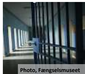
The Prison Museum