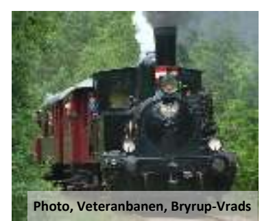
The Veteran Railway