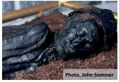
The Tollund Man